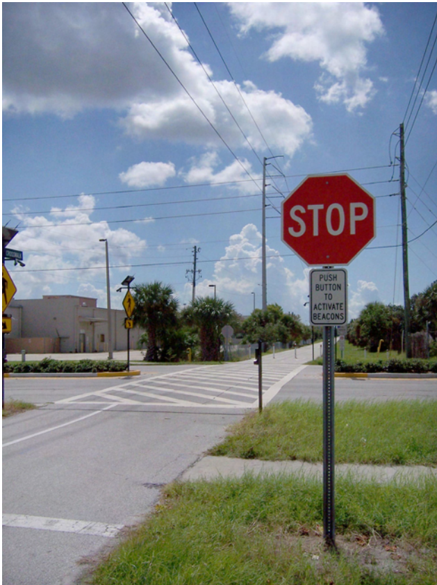
Figure 7. Sign to remind users to push the button.

The results pertaining to the trail users being able to cross completely after the installation of the RRFB are particularly gratifying, as this definitely indicates an improvement in safety. The percentage of motorist yielding from the data collected by the on-scene observer are greater than the percentage seen from the videotape data and tend to closely approximate the findings from the earlier uncontrolled crosswalk studies in St. Petersburg. These earlier studies usually involved a staged crossing, where a pedestrian would place a foot in the crosswalk to set up the interaction with a motorist whose vehicle was outside of the dilemma zone. Florida statutes require motorist yielding when the pedestrian is in the crosswalk. Enforcement operations using police equipped with radios who posed as pedestrians also were used to reinforce that yielding was expected. None of the data gathered in the present study pertained to staged crossings, and no enforcement operations were employed. The videotape set up did not allow a determination of whether motorists were in the dilemma zone when the flasher was activated. Thus, any motorist proceeding through the crossing with the flasher activated was coded as not yielding. This procedure likely accounts for the difference in the motorist yielding rates between the videotape versus the observer results.