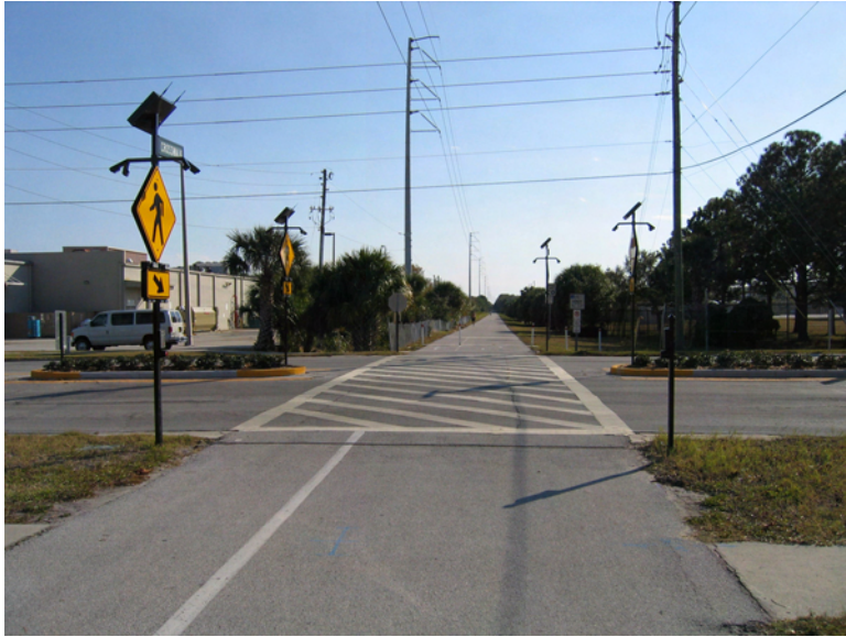
Figure 2. RRFB at the Pinellas Trail crossing.

The decision had been made by the Neighborhood Transportation section to install a safety treatment at a street crossing with the Pinellas Trail. A consultant examined candidate locations and recommended that a RRFB be installed at 22 nd Avenue North and the trail. This was the device previously evaluated at uncontrolled pedestrian crosswalks in St. Petersburg and described in the introduction and literature review. The RRFB system was installed on August 2, 2008 (Figures 2 and 3) and included beacons and signs on the edge of the roadway and in the median, as well as a push button to activate. The vendor was Stop Experts, Inc., and the cost of the system was $26,050.