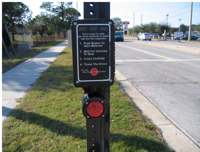
Figure 3. Push button configuration at the trail crossing.