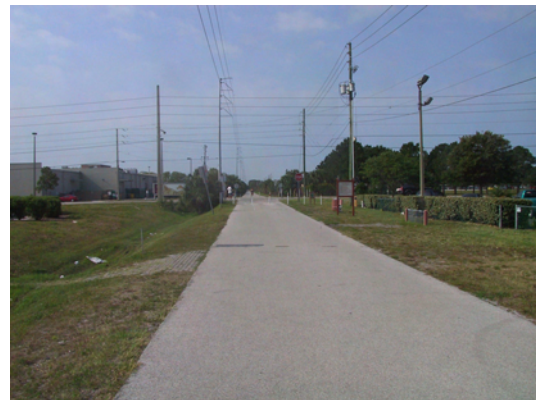
Figure 5. View of trail before RRFB.