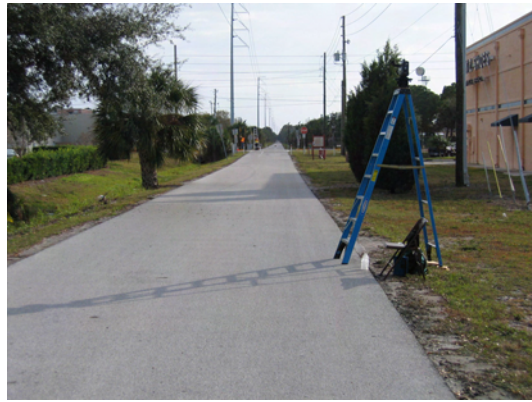
Figure 6. Videotape data set up.

The experimental design was to collect data of trail users before and after the installation of the RRFB. Videotape data were collected by a staff person from HSRC during several time periods before and after installation. A camera was set up on a stepladder beside the trail and several hundred feet from the actual trail crossing, and videotape was collected from both directions of travel (Figure 6). Data were collected at various times of the day on both weekdays and weekends when it was not raining.